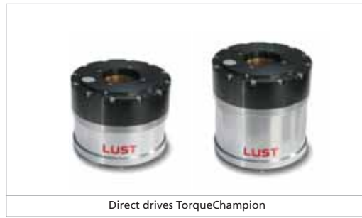
Direct drives TorqueChampion